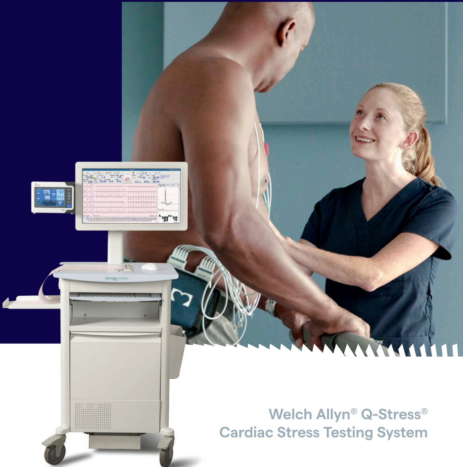
Welch Allyn® Q-Stress® Cardiac Stress Testing System